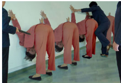
Riding the Airplane