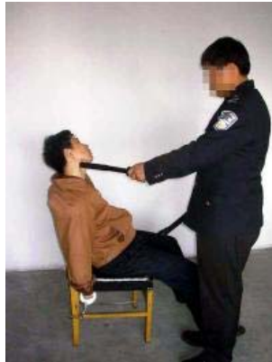
Shocking with Electric Batons